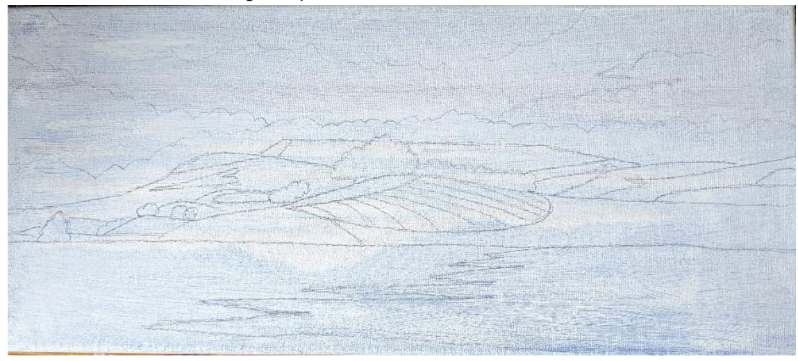
Looked at a few poster paintings and decided to do in that style. As this is very much an experiment sanded and gessoed over a previous painting. Then added the outline drawing.