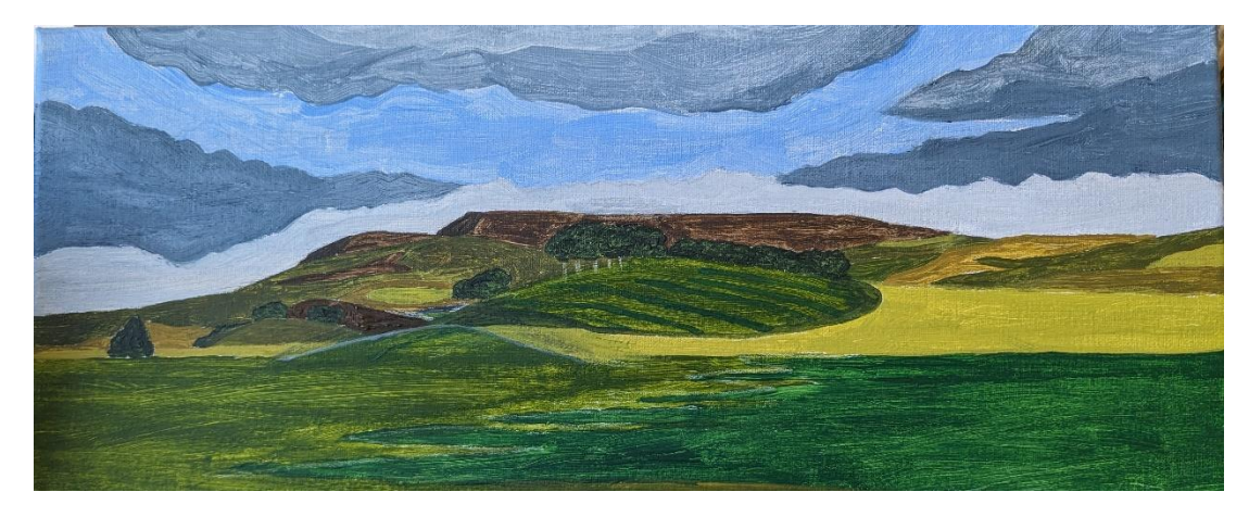
Next task was to sort out the adjustments. Composition looks better.