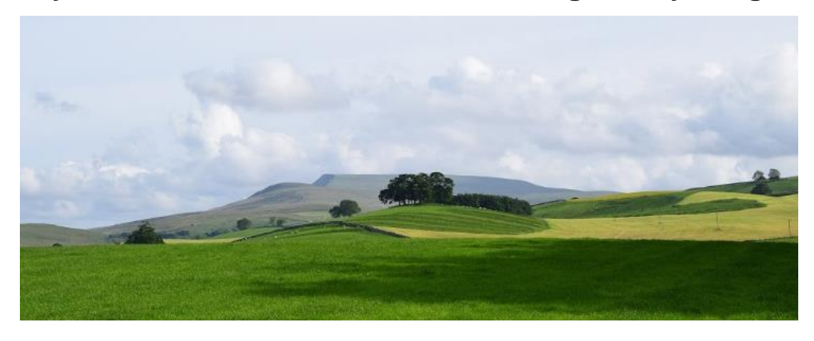
I think my favourite view of Wild Boar Fell. I like the tones in this and it reminded me of a poster painting.