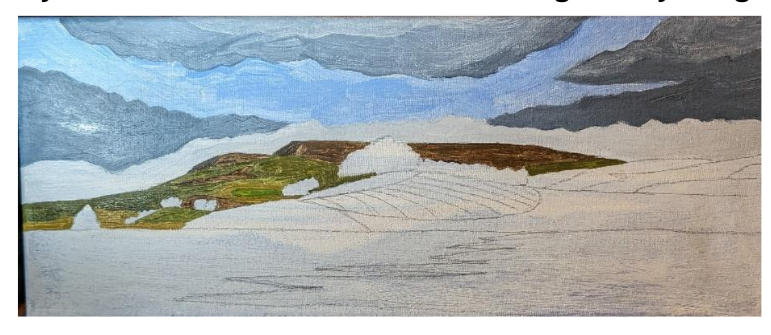
Blocked in the sky with ultramarine, burn umber and white mixtures. Used combinations of Raw Umber, yellow ochre, ultramarine and sap green to paint in the left of the fell