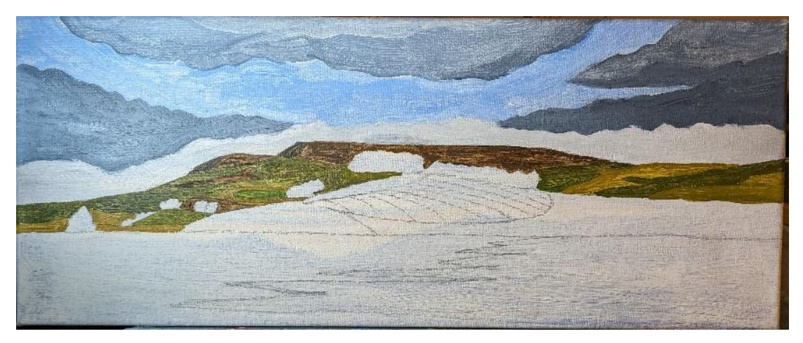
Continued the right of the fell.