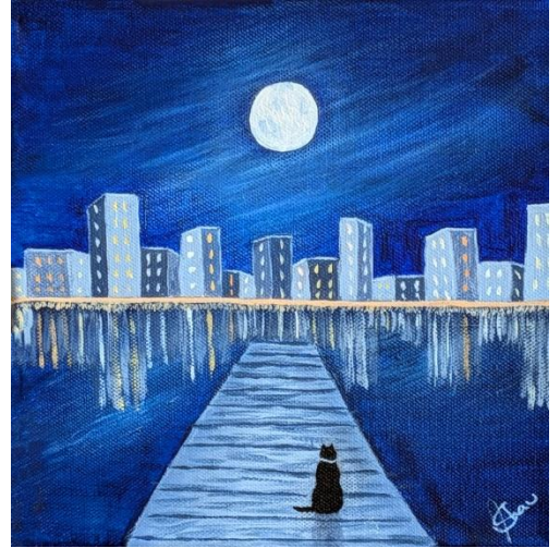
Pier CATching 1

Continuing with my CATching series. After completing Pier CATching 1 – 20 x 20 cm. I decided to continue with some larger images 30 x 30 cm